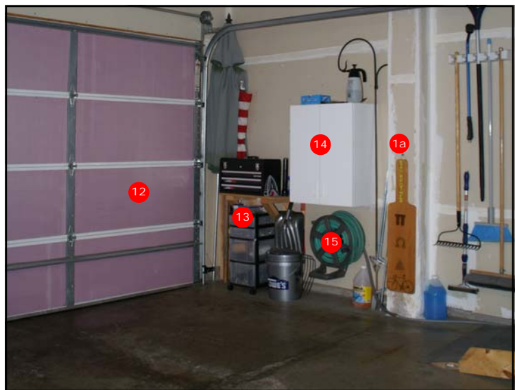
Figure 3: The left front corner of the garage, showing the insulated garage door (partial view), tool box shelf, wall-mounted cabinet and wall-mounted hose reel

13 Toolbox shelf: This was one of the items whose placement was important, as it represented one of the