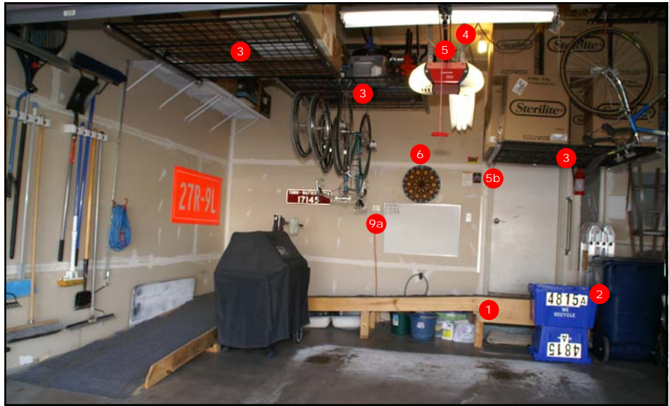
Figure 1: Partial view of the back and left walls of the garage, highlighting the ramp, garbage can and recycling bin placement, overhead storage lifts, lighting, garage door opener and dartboard

1 The ramp: With the need to overcome a vertical drop of 17" from the entry door threshold to the garage floor, conventional wisdom suggests that we required 17' of ramp to achieve the standard 1:12 rise to run ratio. Given the slightly off-center placement of the entry door on the back wall of the garage, and the 18'4" width of that wall, we chose to wrap the ramp from the back wall to the left wall. Factoring in the need for level platforms at both the entry door and the corner where the ramp makes its 90° left turn toward the front of the garage meant we were now faced with