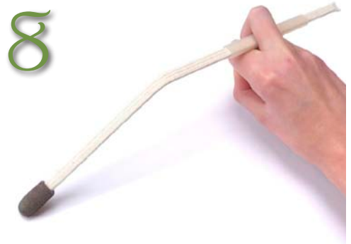
iPad Flex Stylus

Nobody likes fingerprint smudges all over an iPad, but a stylus can sometimes be too small and hard to hold.