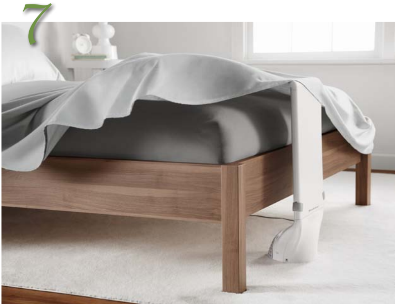
Brookstone Bed Fan

The Brookstone Bed Fan can change that with some nice cool air. It tucks between the top and bottom sheets and circulates air to disperse built-up body heat and keep you comfortable all night long. The Bed Fan can also help save on the AC bill by sending a breeze over the body rather than the entire house.